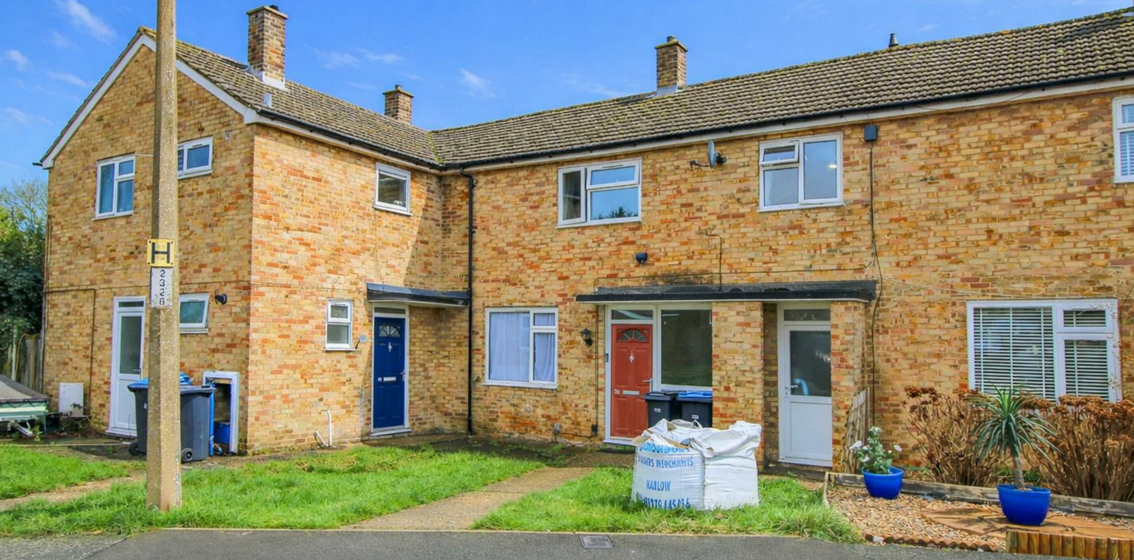
The Readings, Harlow, CM18 7BU Guide Price £400,000